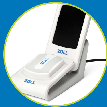
Gateway device on charger

Contact ZOLL before using your device for the first time to allow us to assist with setup. If you do not call within two days of receiving your device, a ZOLL representative will call you to help with setup. Please note that our callerID will show the number 1.412.968.3658 from Pennsylvania.