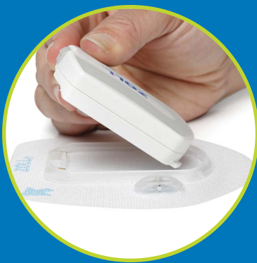
Sensor snaps into patch

After your doctor prescribes ZOLL HFMS, you will receive a package in the mail containing all parts of the device: